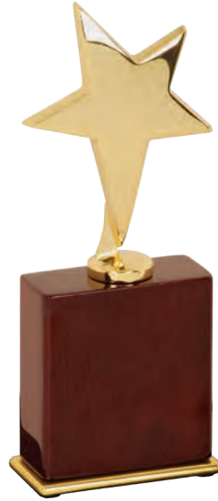
EX021 Gold Star Award on Rosewood Piano Finish and Gold Metal Base Size: 7 1/2"