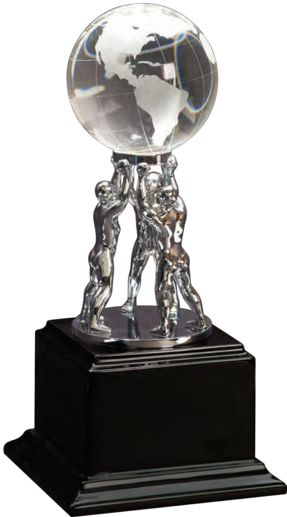
EX001 Crystal Globe on Silver Metal Stand on Black Piano Finish Base Size: 10"

Executive Awards are stunning designs perfect for recognizing teamwork. These high quality crystal & metal globes are mounted on black piano finish bases.