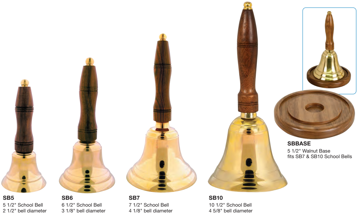
SB5 5 1/2" School Bell 2 1/2" bell diameter

Solid Brass School Bells have wooden handles and are individually boxed. Not intended to be oxidized.