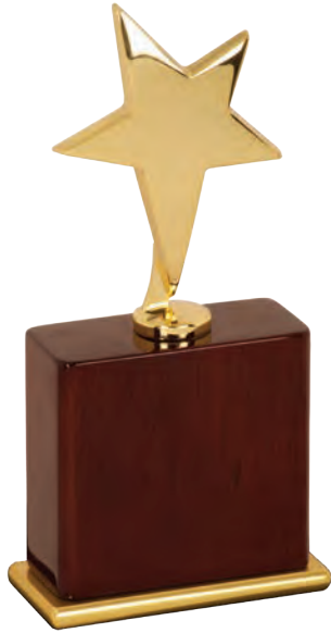
EX022 Gold Star Award on Rosewood Piano Finish and Gold Metal Base Size: 8"

Polished Metal Star Awards are a great way to recognize outstanding achievements.