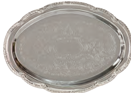
Chrome-Plated Oval Tray