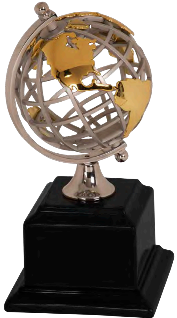
EX003 Gold/Silver Metal Globe on Black Piano Finish Base Size: 8 3/4"