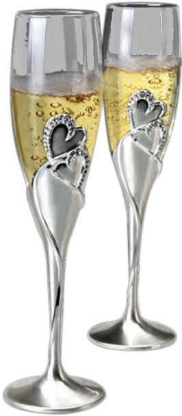
WED001 "Hearts" Toasting Flute 2 Glass Set

All "Hearts" Wedding Accessories come in a gift box.