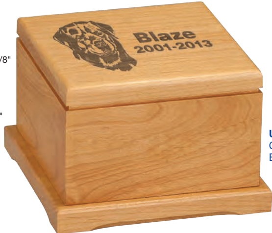
URN11 4 1/2" Tall Red Alder Pet Urn Box Dimensions: 5 3/4" x 5 3/4" x 3 5/8" Base Dimensions: 6 1/2" x 6 1/2" x 3/4" Inside Dimensions: 4 1/4" x 4 1/4" x 3"