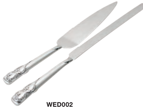
WED002 "Hearts" Cake Server 2 Knife Set