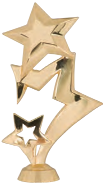
SST2G Gold Metal 3-Star Figure Size: 6"

High Polish, Solid Metal Stars all have studs for mounting with traditional hardware.