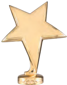
SST1G Gold Metal Shining Star Figure Size: 4 1/2"