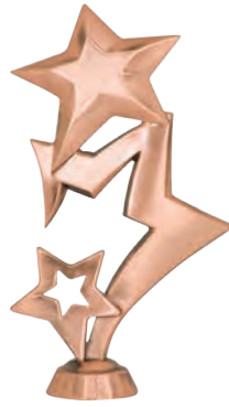
SST2B Bronze Metal 3-Star Figure Size: 6"