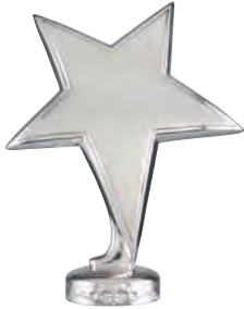
SST1S Silver Metal Shining Star Figure Size: 4 1/2"