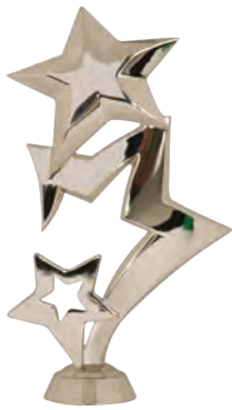
SST2S Silver Metal 3-Star Figure Size: 6"