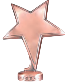
SST1B Bronze Metal Shining Star Figure Size: 4 1/2"