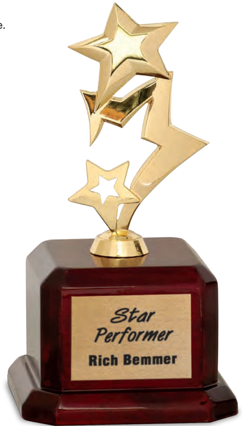
SST2G Shown completed on RPB601 rosewood piano finish base.