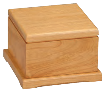
URN01 3 1/4" Tall Red Alder Pet Urn Box Dimensions: 5" x 5" x 2 1/2" Base Dimensions: 5 1/2" x 5 1/2" x 3/4" Inside Dimensions: 3 1/2" x 3 1/2" x 1 7/8"