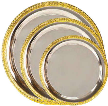
Gold-Rim Silver-Plated Tray

All Silver & Chrome Trays are engravable and are individually boxed.