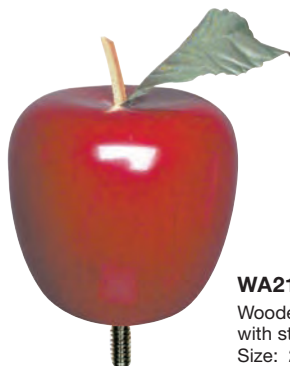
WA21 Wooden Apple with stud Size: 2 3/4"

Colored Wooden Apples are the perfect way to recognize educational leaders and accomplishments. Wooden Apples are available in either base mount or plaque mount applications.