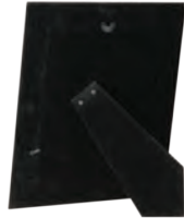
WED004 "Hearts" Photo Frame holds 5" x 7" photo