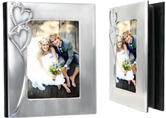
WED007 "Hearts" Photo Album Cover holds 5" x 7" Internal pages hold 60 - 4" x 6" and 10 - 6" x 8" photos