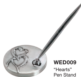
WED009 "Hearts" Pen Stand with Pen