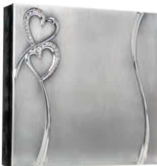
WED008 8" x 8" "Hearts" 40 page Guest Book