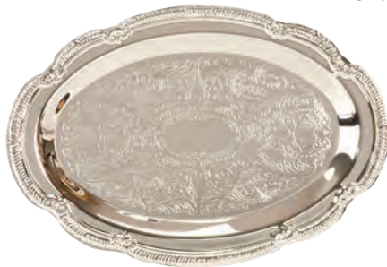
Silver-Plated Oval Tray